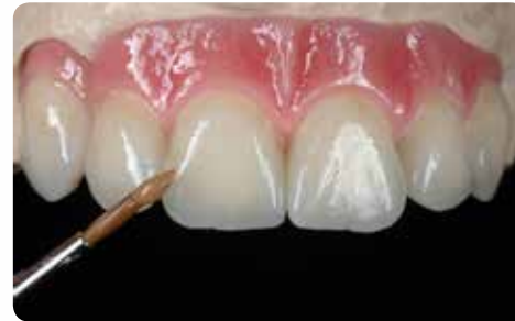
Characterisation with V-Shades