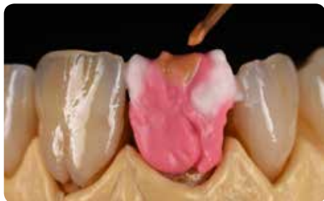
Stain internally ...