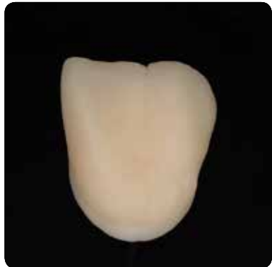
Crown with fine texture ready to be glazed

Initial Spectrum Stains can be applied in the user's preferred consistency, as a paste or more liquid. Regardless of the used consistency, the end result will be the same: staining and gloss with very fine definition, preserving the surface texture of the restoration; they are the 2D counterpart of the Initial Lustre Pastes NF.