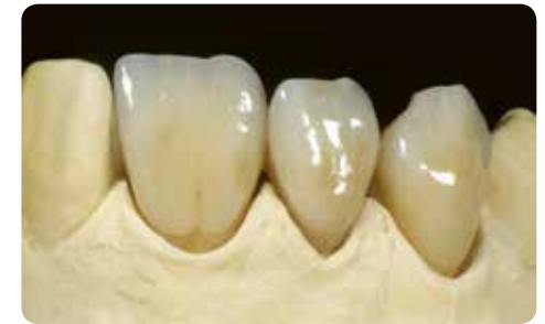
Final Restoration showing colour and gloss