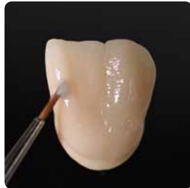
Glazing with liquid or paste consistency