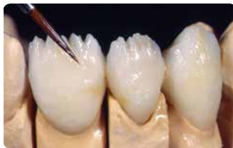
Application of Lustre Pastes NF (+firing)