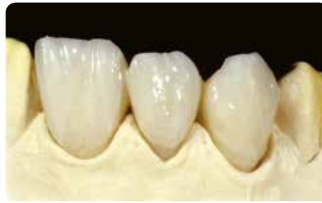
Application of LP Neutral