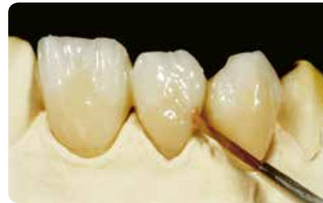
Application of Body Shades