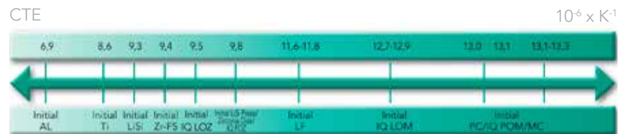
Compatibility with the Initial ceramic line

Both products are complementary. In some cases they are used both; for example, the Spectrum Stains can be added to the Lustre Pastes NF or to the ceramic build-up powders.