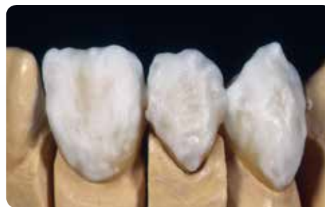
Application of Opal/Incisal Masses (+firing)