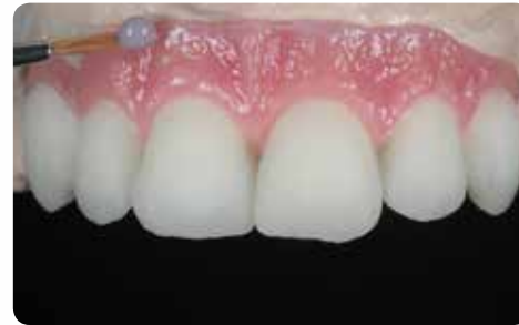
Application of the different Initial Lustre Pastes NF Gum Shades