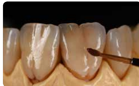
... or externally