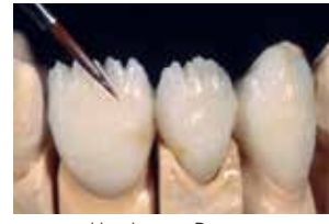
Use Lustre Pastes