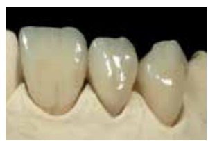
Final Restoration offering colour & gloss

With the Lustre Pastes NF you can easily modify your conventional ceramic crown and bridgework. Changing the brightness, colour and value has never been so easy!