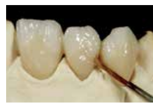
Application of Body Shades