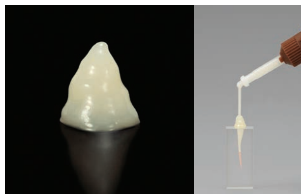
Ideal Thixotropy for Core Build-up