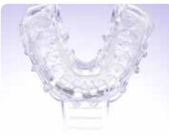
2. Fill the impression tray with EXACLEAR and take an impression of the wax-up on the model