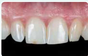
1. Initial situation

EXACLEAR's transparency allows you to check every little detail and prevents the formation of an oxygen inhibition layer, thus facilitating the final polishing. G-ænial Universal Injectable is well suited for this technique because of its thixotropy, strength and gloss.