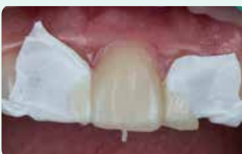
7. Light-cure through the silicone key and then remove it