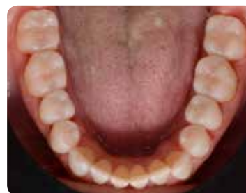
3. Situation after treatment using the injection moulding technique