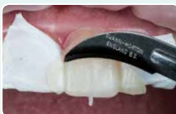
8. Remove excesses of composite with a blade