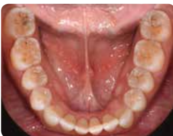
1. Initial situation

The injection moulding technique is also ideal to treat wear cases or to recreate complex morphologies. The transparency of EXACLEAR helps to see and control the injection while treating several teeth simultaneously. The high flexural strength and wear resistance of G-ænial Universal Injectable are ideal for such posterior cases.