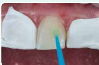
5. Isolate the neighbouring teeth, etch the enamel and apply a bonding agent