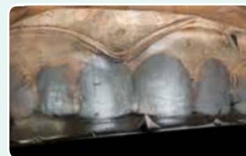
3. After setting, remove the clear silicone from the tray