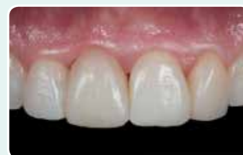
9. Final result after a few polishing steps