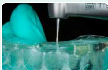
4. Drill a hole through the silicone key to create space for the composite tip