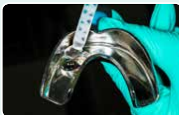
2. Fill the impression tray with EXACLEAR and take an impression of the wax-up on the model