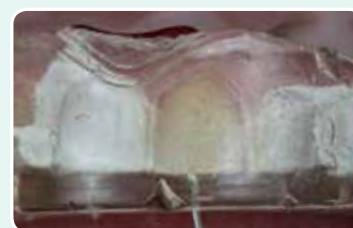
6. Place the silicone key in the mouth and inject G-ænial Universal Injectable through the hole in the key