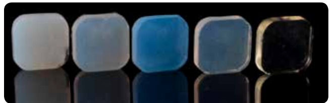
Transparency of EXACLEAR (far right) in comparison to competitors.

This leads to a higher conversion rate and avoids the formation of an oxygen inhibition layer, making the final polishing easier .