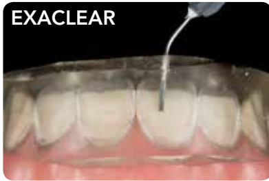
Visual control of composite injection.

EXACLEAR is an innovative, clear silicone material that fulfils the needs of demanding aesthetic cases and facilitates the way to great results. Its absolute transparency makes it particularly effective in complex clinical situations.